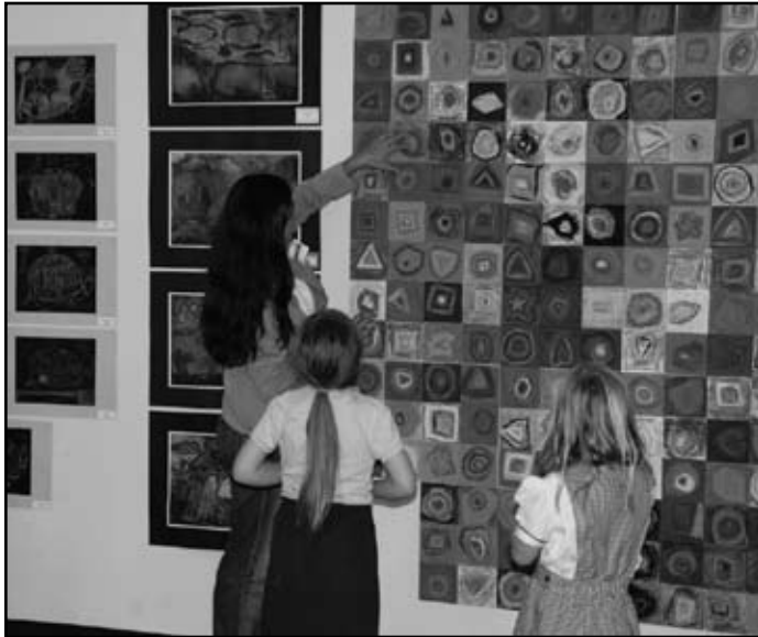
Students and a parent discuss the Kandinsky-inspired Kindergarten work.