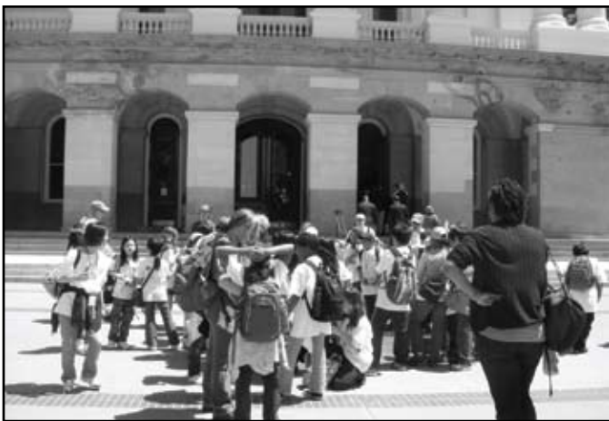
The students tour the city.

The third day was the best day of the whole trip. During playtime, I climbed on tires and played on the slide with Sora. Now here comes the great news! We started hiking up a huge hill. It was tiring, but fun at the same time. We had bagels at the top.