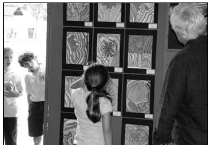
A student points out her work in the show.