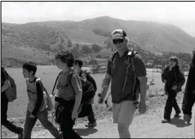
On a hike along the coastline.

The next day, we went to the wetsuit deck and learned how to put on wetsuits for snorkeling. Then we each found a buddy and dived in for our first snorkeling adventure. It was marvelous because you get to see all these amazing fish in crystal clear water. It was like you see on TV, except better because it's real. I saw a bat ray and some sting rays.