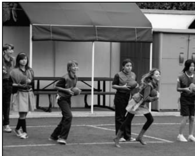
Sixth Graders play flag football.

Although I am a little nervous about the thought of going to middle school, there are also many things that I am very excited about. Next year I will be at Harvard-Westlake Middle School. It will be a new environment with different challenges. First of all, the school is certainly bigger than St. James'. This means that there will be many more students and teachers to get acquainted with. I have been used to the same campus for seven years, and