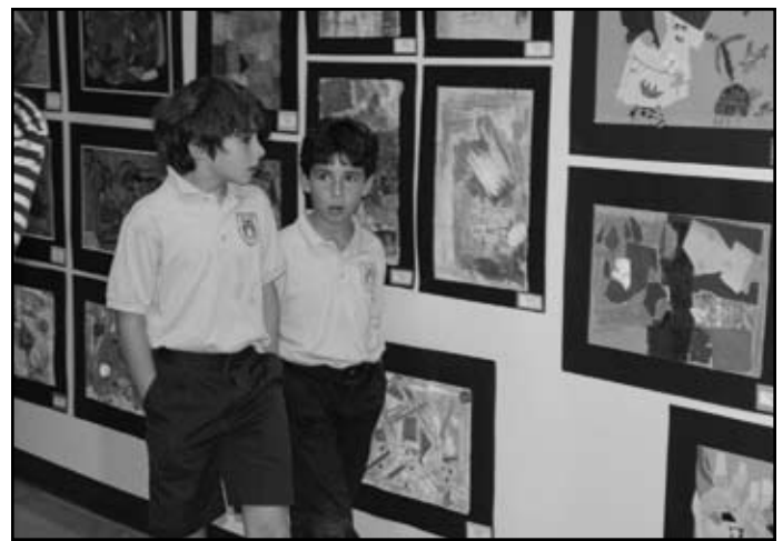
Students visit the gallery in St. James' Hall.