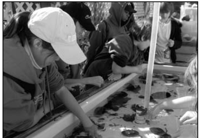
Students investigate the touch tank.