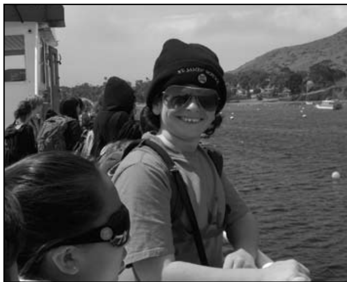
On the ferry to Catalina.

We put on our swimming gear and went kayaking. It was a lovely, sunny day and we paddled to Fourth of July Bay and back. We learned about brown kelp.