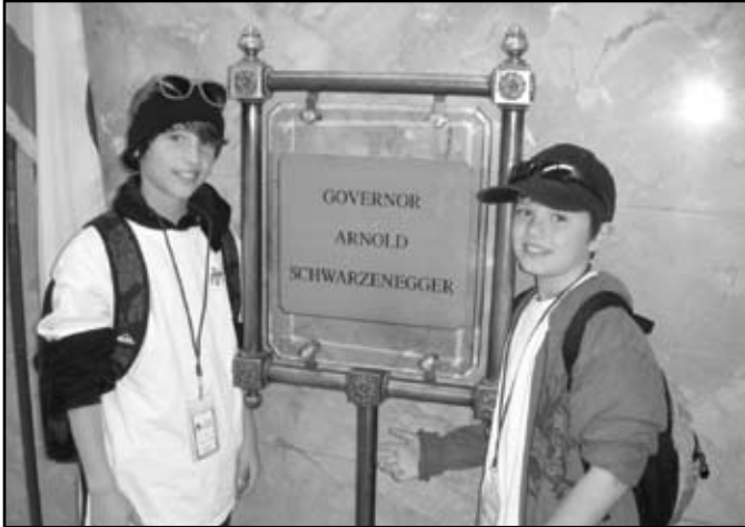
Fourth Graders stop to pose for the camera.

After a yummy breakfast at our hotel we rode in a coach to the Gold Bug Mine and went to a gift shop. I only bought a turtle key chain and two mini railroad spikes. Then the coach took us to The Coloma Outdoor Discovery School (CODS) where we stayed for three days and two nights.