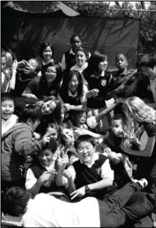
A Sixth Grade group hug.