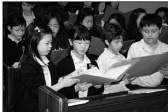
The St. James' Choir sings in chapel.