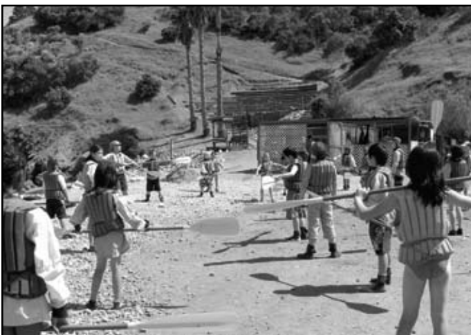
Fifth Graders learn to kayak.

After lunch we snorkeled some more. And after dinner, there was an optional night snorkeling where you get some extra bits of equipment for your wetsuit. On the top of your snorkel, you get a glow stick to show where you are and a flashlight. I saw some bio-luminescent plankton, a giant bat ray and a very big