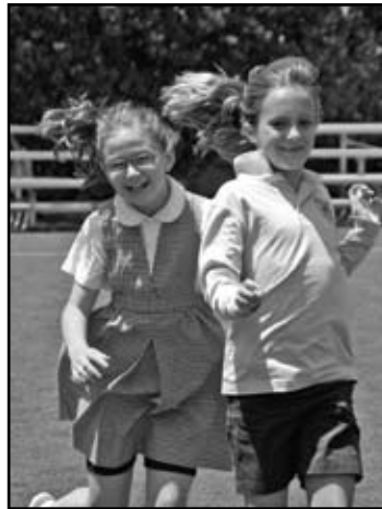
Second Graders play during recess.

I will remember my teachers and what they taught me – whether it is school lessons or how to behave in school. I am positive that their lessons will help me in middle school, high school, college, and when I am an adult. My teachers have all been kind and generous with learning opportunities. Their wise words will echo through my head and tell me right from wrong in difficult situations.